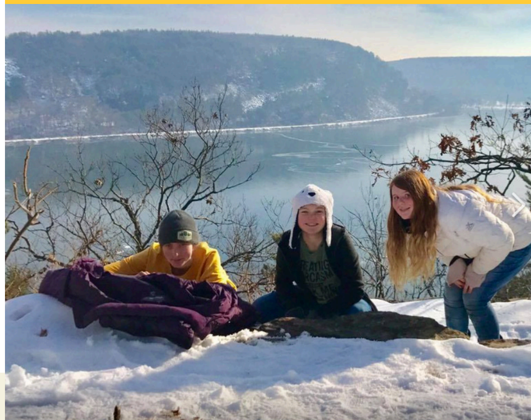
ABOVE: The newest cohort of the Ozarks Teacher Corps, an initiative to recruit and retain excellent rural educators. RIGHT: Students from Cambridge, Wisconsin's Koshkonong Trails School visit a local state park.