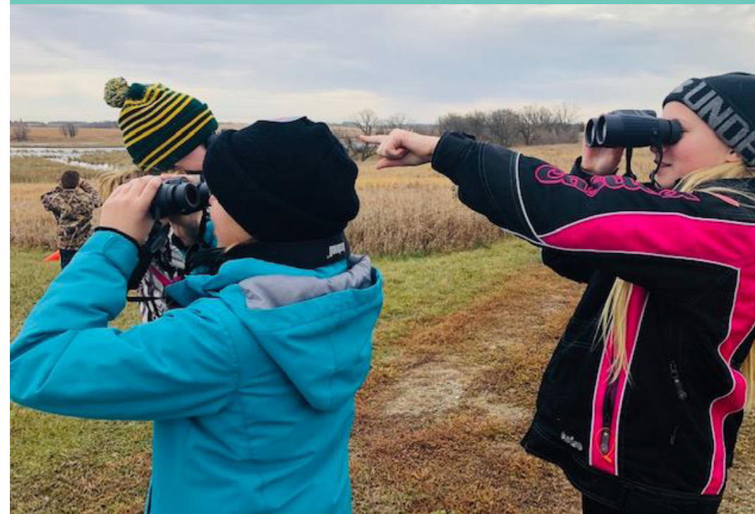
ABOVE: Students from Lake Park Audubon Elementary School explore their rural backyard through the lens of birding. LEFT: New Hampshire's Baker River Project engages students in a place-based learning opportunity with a public impact.